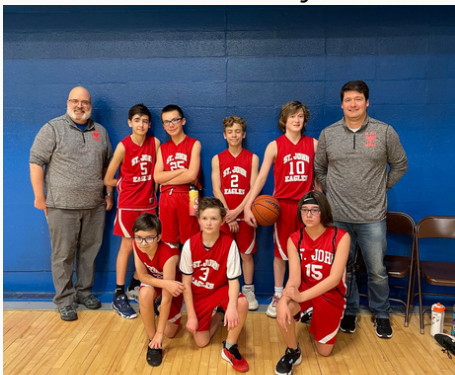
7th Grade Boys