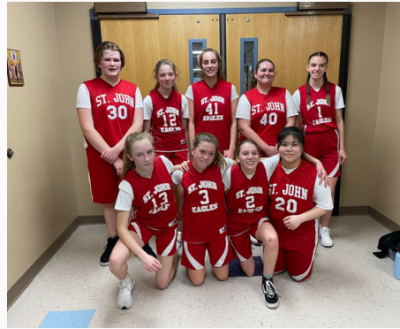
8th Grade Girls