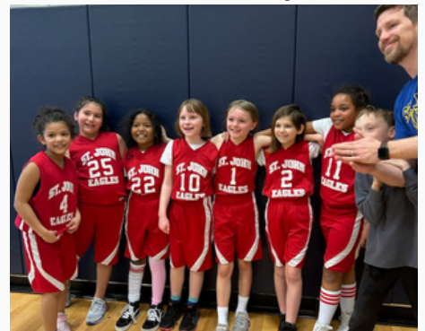
3rd Grade Girls