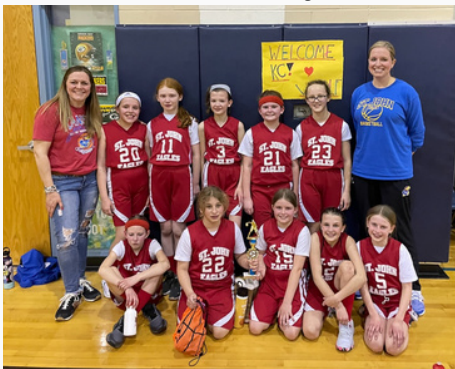
5th Grade Girls