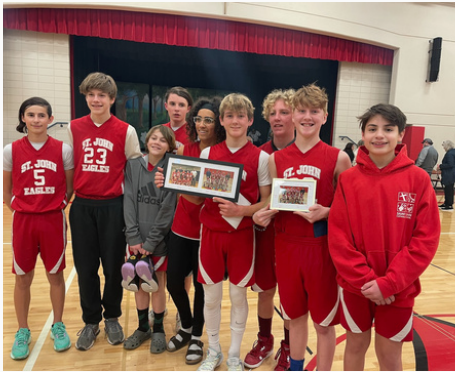
8th Grade Boys

Congratulations to the 7th grade girls on their First Place win! Also, congratulations to the 5th grade girls and 5th grade boys on their second place finish. Congratulations to all the teams on a good season! Thank to all the coaches for their hard work.