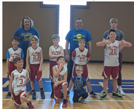
3rd Grade Boys