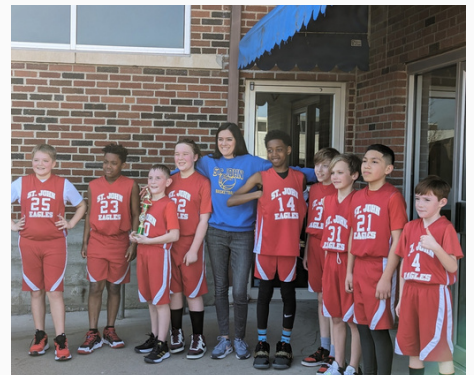
5th Grade Boys