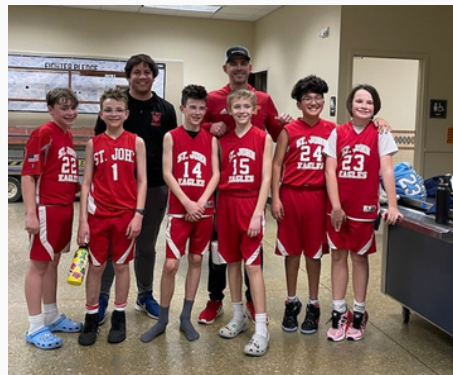
6th Grade Boys