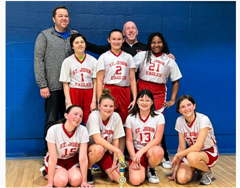
7th Grade Girls