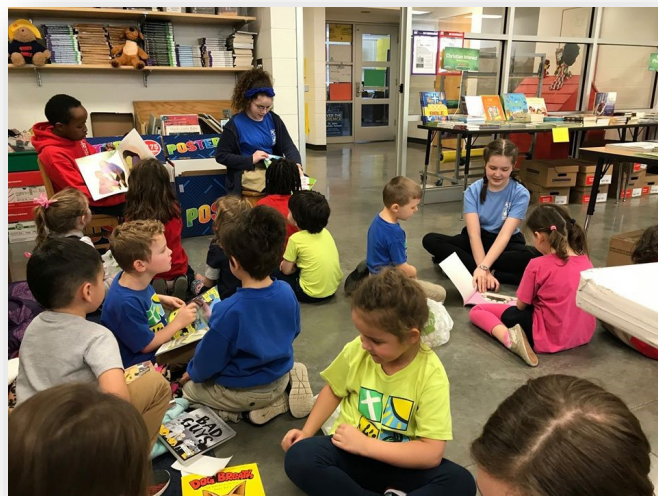
Sixth grade students read to the Preschool class in library.