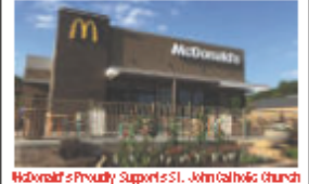
McDonald's Proudly Supports St. John Catholic Church