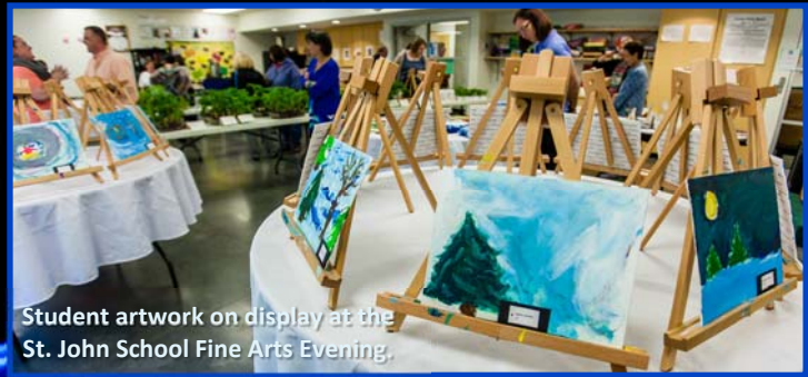
Student artwork on display at the St. John School Fine Arts Evening.