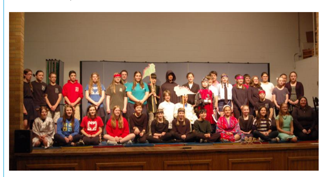
Middle School Theatre Class Production