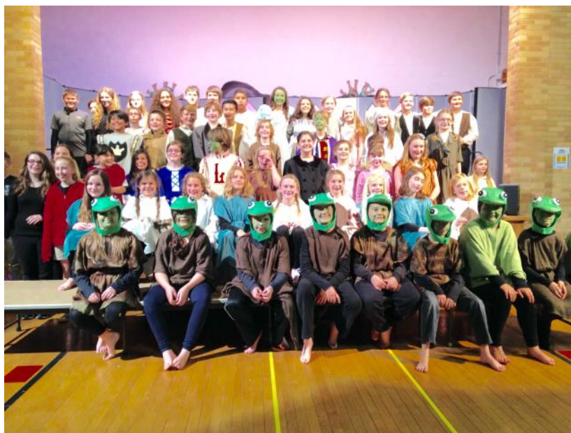
“The Frog Prince”