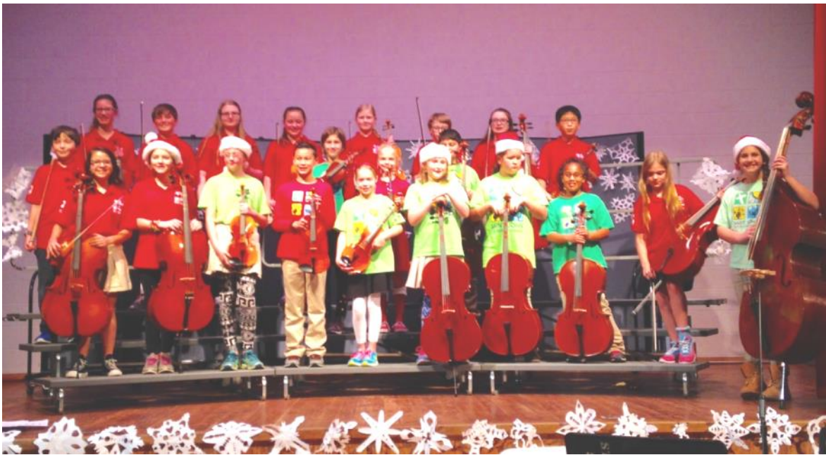
Band Orchestra Alleluia Singers